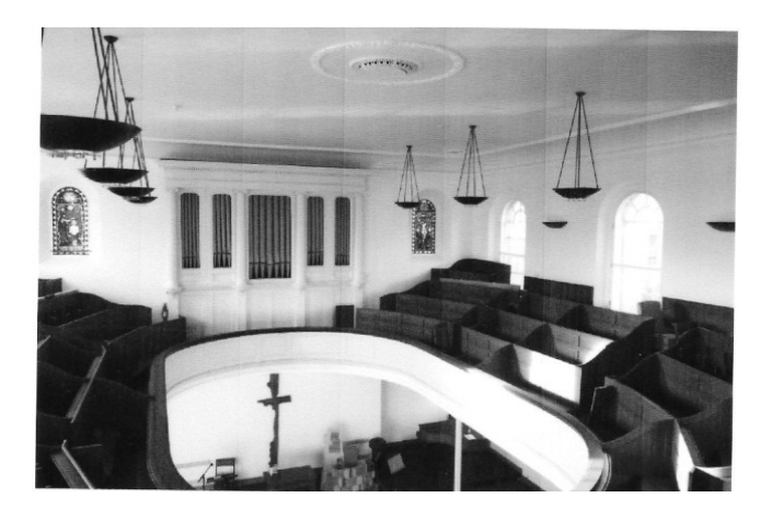
North Road Methodist Chapel.

Two properties at the head of Saddler Street – 'Salvation 21' (Salvation Army) and 'The Varsity' public house - illustrate how simple design adjustment can achieve marked uplift, while the rejuvenating effect of an appropriate coat of paint is shown in Prebends' Cottage. This modest stone cottage no longer hides unnoticed amidst the foliage on its corner site on the way to the bridge.