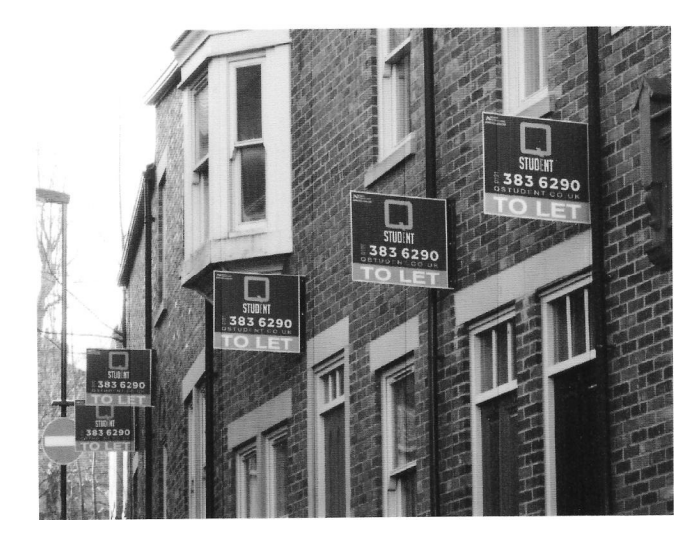
<sup>4</sup>To Let' signs, The Maltings.

A flurry of 'To Let' signs for student accommodation has returned again to those parts of the City most characterised by 'studentification.' It has not reached 'forest' proportions of a few years ago, when the Trust Bulletin contained a picture of Mitchell Street with threequarters of the houses displaying signs, but there are still 'hot-spots.' At the bottom of South Street, for instance, why do all six premises constituting The Maltings need a sign? And why have they been displayed – at the time of writing – for two months?