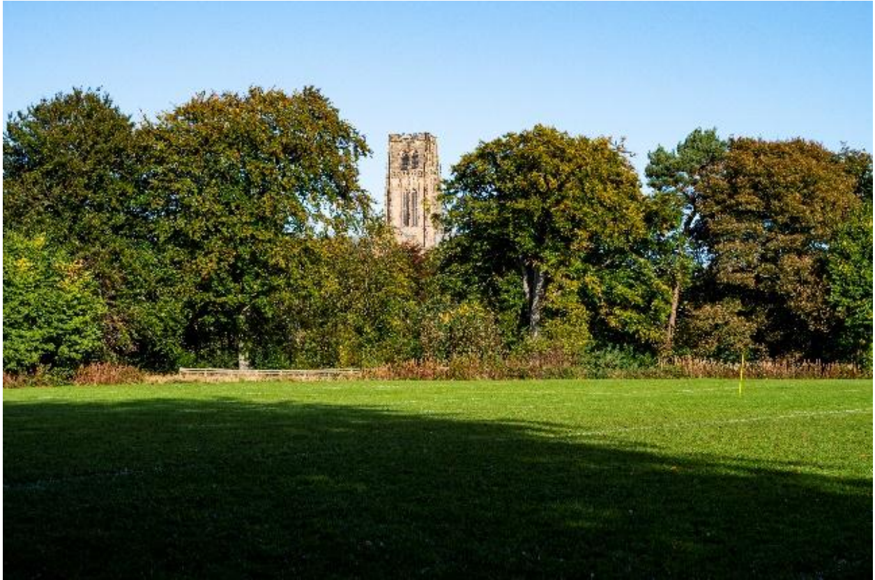
View of Cathedral over Palmers Garth

The current building is a modest single-storey building surrounded by a hedge. The combination of the two is appropriate to its greenspace setting at present. The more relaxed character of this is in contrast to the terrace opposite but appropriate to the greenspace. The hedging continues along the boundary to Palmers Garth greenspace used as a playing field.